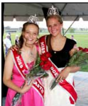
Miss 16 Winners