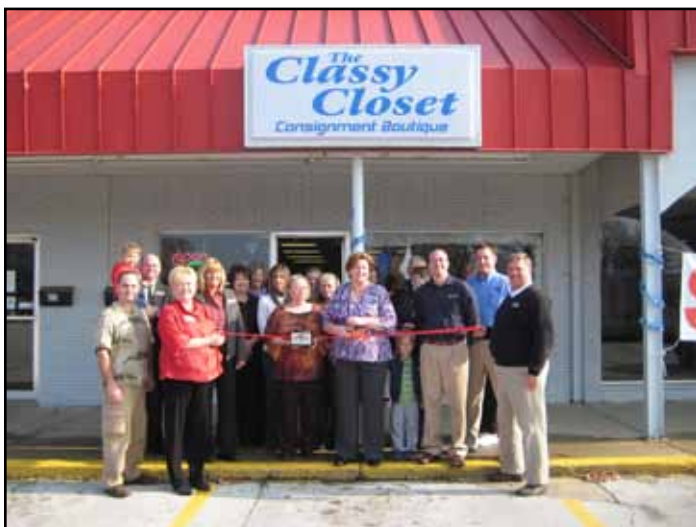
The Classy Closet 639 S. Ankeny Blvd. Ankeny, IA 50021 (515) 210-1438 www.theclassycloset.vpweb.com