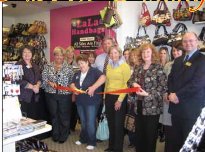
La La Handbags 2010 S.E. Delaware, Suite 234 Ankeny, IA 50021 (515) 964-1994 www.lalahandbags4u.com