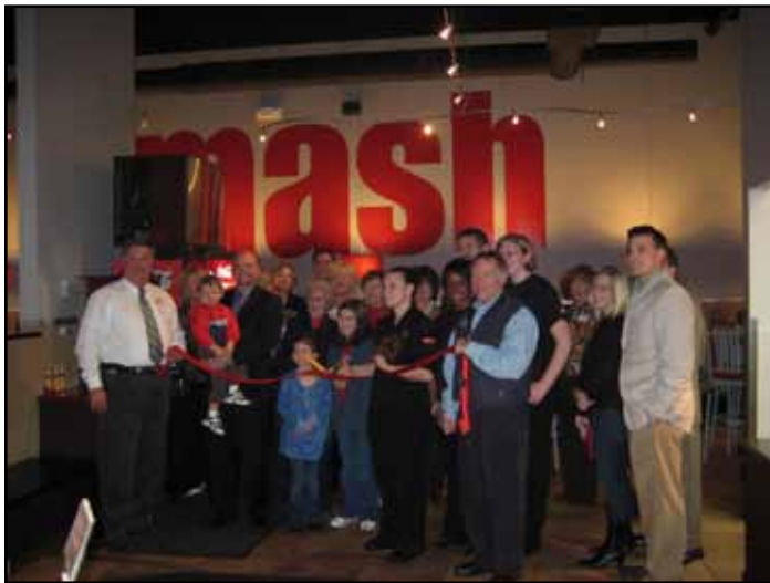
Smashburger 2010 S.E. Delaware Ave., Suite 222 Ankeny, IA 50021 (515) 963-5100 www.smashburger.com